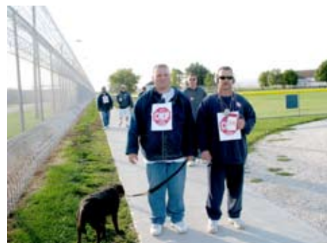
NCCF CROP Walkers had beautiful, cool weather.