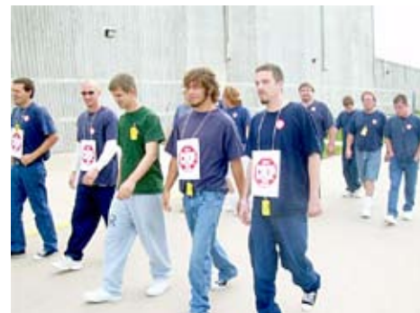
Many participated in the FDCF CROP Walk.