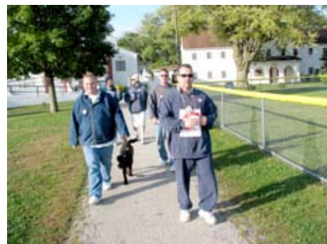
NCCF CROP Walkers starting around the walk.

A total of 7 walkers walked the 3 miles at NCCF on Saturday, October 4, and 51 walkers participated in the Annual CoDR CROP Walk for world hunger at FDCF in two walks on Sunday, October 5. Total donations are estimated to be about $80.00. Donations are sent to Church World Service for the hungry, and 25% is sent back to the Fort Dodge community for local hunger programs, and an additional 10% for flood victims in our area.